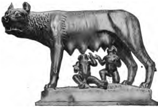
Fig. 99. The wolf with Romulus and Remus.

as his daughter's child. Amulius met at the young men's hands the death he deserved, and Numitor was restored to his kingdom. But Romulus and Remus, having a particular affection for the hills where they had lived as boys, put themselves at the head of a band of young men and set out to found a new city on the banks of the Tiber. A dispute arising between the two